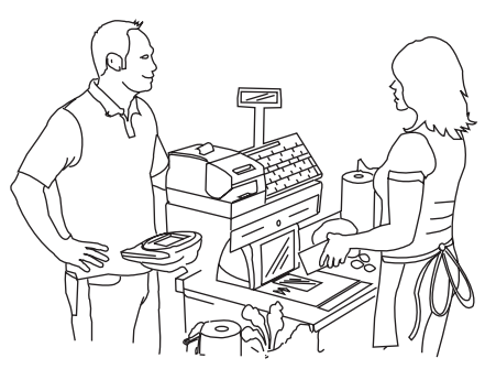
a | Scanning Correct forward-facing posture.

Customer Facing Activities Throughout The Process