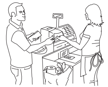
d | Contact With The Customer

Saves up to 5 seconds on payment transaction. All peripherals located within easy reach.