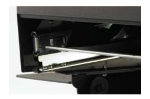
d | Flip Up Base Unique hinge design allows for easy scanner removal.