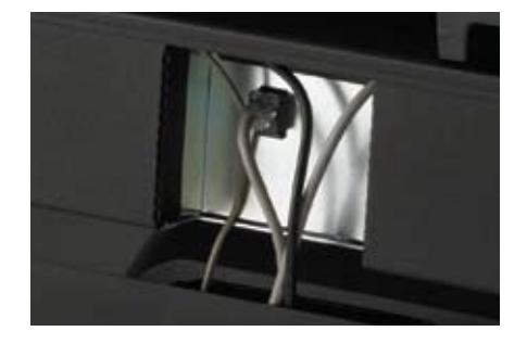
b | Removable Top and Rear Panels

Ready access for cables and peripheral interconnections.