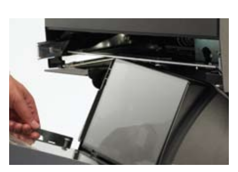
e | Lowest Possible Height Cash drawer located immediately above the scanner — installation and removal is easy.