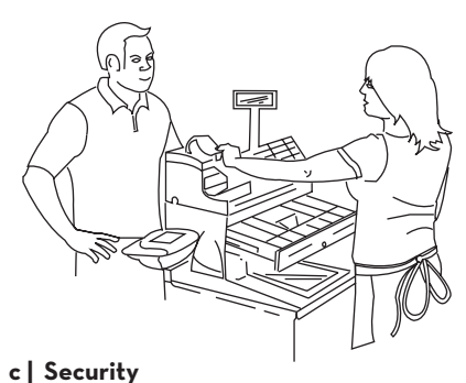
Provides better open-till security.