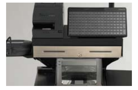
b | Organizes Peripherals Efficient work station within convenient reach.