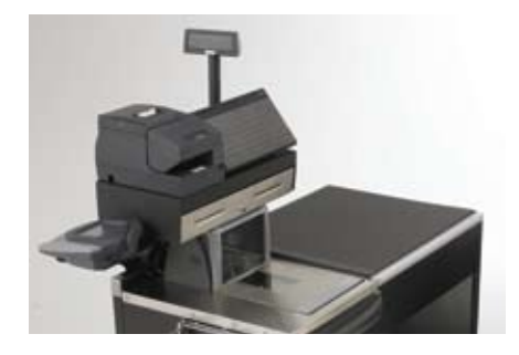
c | Eliminates Need For Side Counter Saves space for increased merchandising.