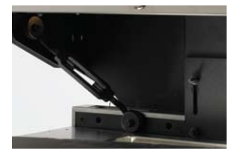
c | Adjustable Height Turnbuckles