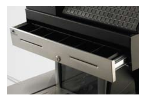
a | Cash Drawer

Serves as the foundation of the workstation.