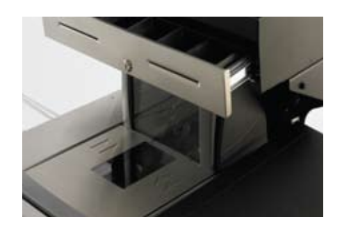
a | Above Scanner Increases productivty and ease of use.