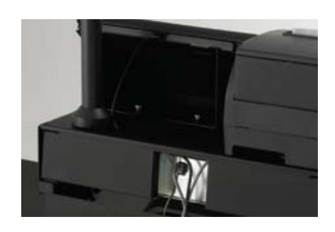
f | Easy Installation and Connection Removable top and rear panels for interconnection of peripherals.