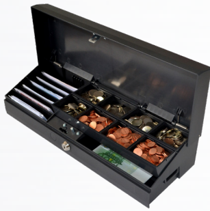
8 Coin & 6 Note 1 Note/Media storage underneath

A few examples of the different coin and note configurations: