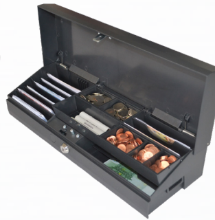
5 Coin & 8 Note 1 Coin roll storage 1 Note/Media storage underneath