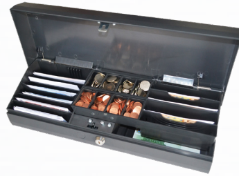
8 Coin & 10 Note 1 Note/Media storage underneath