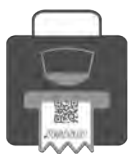
PRINTING AND READING SYSTEM