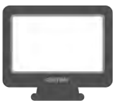
TOUCH SCREEN PCS