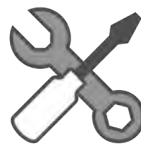
TOOLS AND DRIVERS