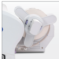
Large Media Supply