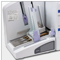
Print, Cut & Stack Operation (Stacker Optional)

Performance. Convenience. Versatility. — SATO's Specialty Series of Printers —