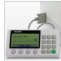
Optional Programmable Keyboard (Stand-alone Operation)