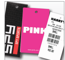
Great for Retail Tagging