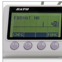
Large, Easy-to-Read LCD Display