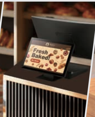
Food and Beverage