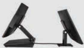
Separated (Up to Two Meters)