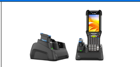
Single Slot USB / Charge Cradle CRD-MC93-2SUCHG-01 - Cradle PWR-BGA12V50W0WW – Power supply CBL-DC-388A1-01 – DC Cable Needs Country IEC Power Cord