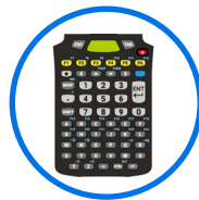
58 Key Func AN KYPD-MC9358ANR-01 KYPD-MC9358ANR-10