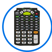
53 Key TE 5250 KYPD-MC93535250-01 KYPD-MC93535250-10