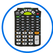
53 Key TE VT KYPD-MC9353VT-01 KYPD-MC9353VT-10