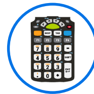
29 Key Function KYPD-MC9329NMR-01 KYPD-MC9329NMR-10