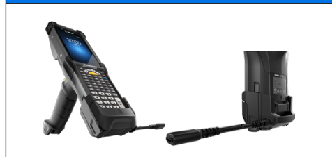
Snap on USBC / Charge Cable CBL-MC93-USBCHG-01