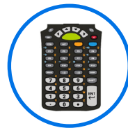
43 Key Function KYPD-MC9343FN-01 KYPD-MC9343FN-10