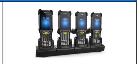
4 Slot Charge Only Share Cradle CRD-MC93-4SCHG-01 - Cradle PWR-BGA12V108W0WW – Power supply CBL-DC-381A1-01 – DC Cable Needs Country IEC Power Cord

Contact your Zebra Channel Account Manager or your Preferred Authorised Distributor for further information. OFFER ENDS DECEMBER 2024