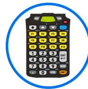
34 Key Function KYPD-MC9334FNR-01 KYPD-MC9334FNR-10