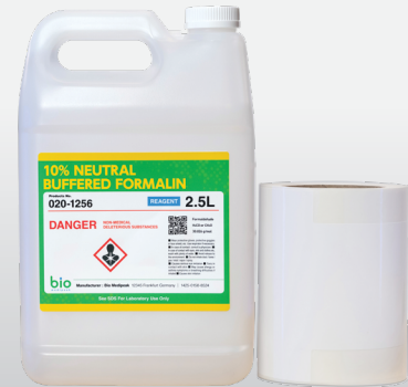
Hi-Res Color and Variable Data Printed in One-Step