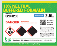
Two-Step Label with Potential for Misalignment