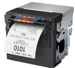
Shown with bezel (optional sold separately)

Paper-saving functions — reduce paper usage by up to 30% 2