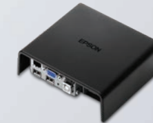
KDS Expansion Module (KD-iB01)