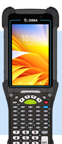
Freezer model for outdoor winter weather

Make sure your mobility solution doesn't stop when the conditions get tough. A heated touch panel ensures continuous visibility operations and heavy condensing conditions. A freezer-rated battery gives workers battery power they can trust during the longest, coldest shifts. And the heated scanner exit window ensures reliable data capture in freezing winter weather.