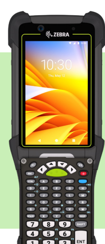
Standard model for general ultra-rugged use