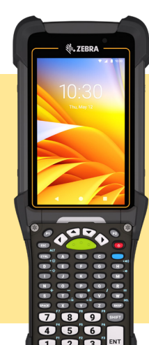
Non-incendive model for use when hazardous materials are present