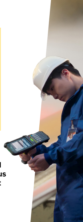
Non-incendive model for use when hazardous materials are present

Let the next evolution of the industry's most trusted mobile computer improve productivity and accuracy in your plant. For more information, visit www.zebra.com/mc9400