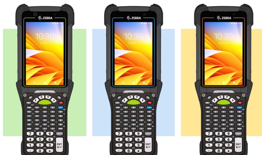
Standard model for general warehouse use

* Non-incendive models available in North America only