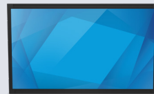
Open Frames 10" to 55"