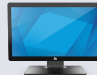
Monitors 7" to 27"