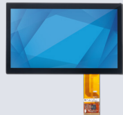
Touchscreen Display Modules 7" to 32"