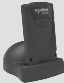
DuraCase Charging Dock*