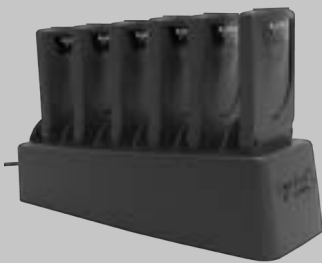
DuraCase Charging Adapter*