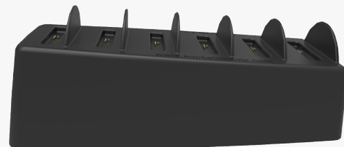
6 Multi-Bay Charging Dock

Connect your DuraCase to either one of the GDS® Charging Docks or Charging Adapter. The exterior docking contacts are specifically engineered for secure docking and charging of both devices in the DuraCase. The charging docks are designed to withstand repeated docking and undocking. Embedded magnets position the DuraCase and hold the docking station in place. Efficient for charging one or many devices.