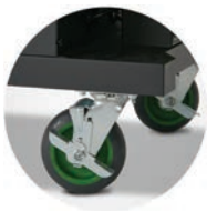
Specialized casters allow for precise and easy movements even at max capacity