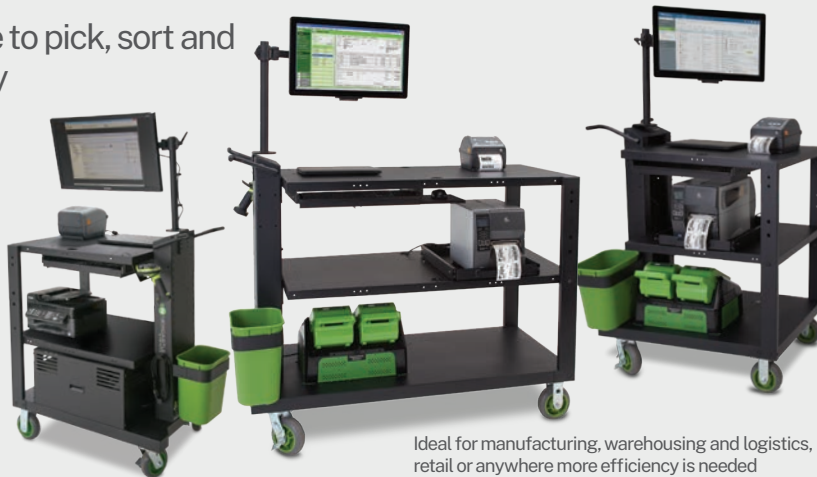
Ideal for manufacturing, warehousing and logistics, retail or anywhere more efficiency is needed