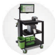
Available in 30" or 48" tabletop means greater configuration possibilities