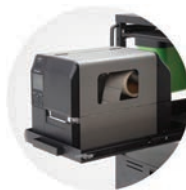
Optional slide-out shelf can support a wide variety of equipment up to 60 lbs.

Enough space to pick, sort and pack on the fly